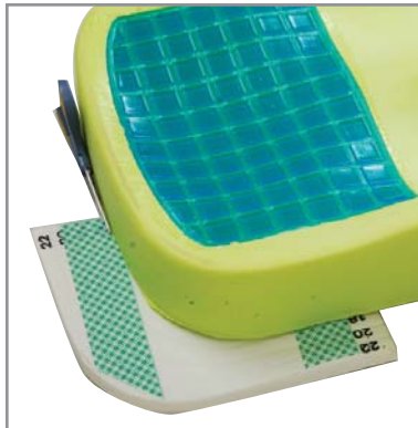
POK – Pelvic Obliquity Kit (2 pieces) accommodates up to one inch of obliquity