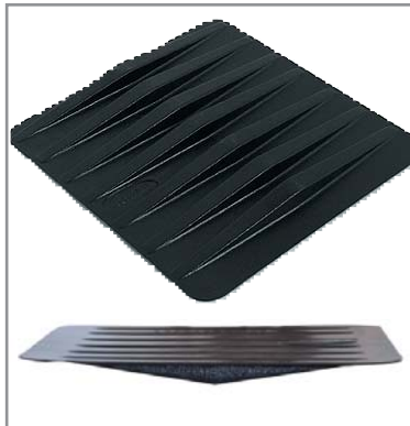
Cushion Rigidizer – lightweight and low profile